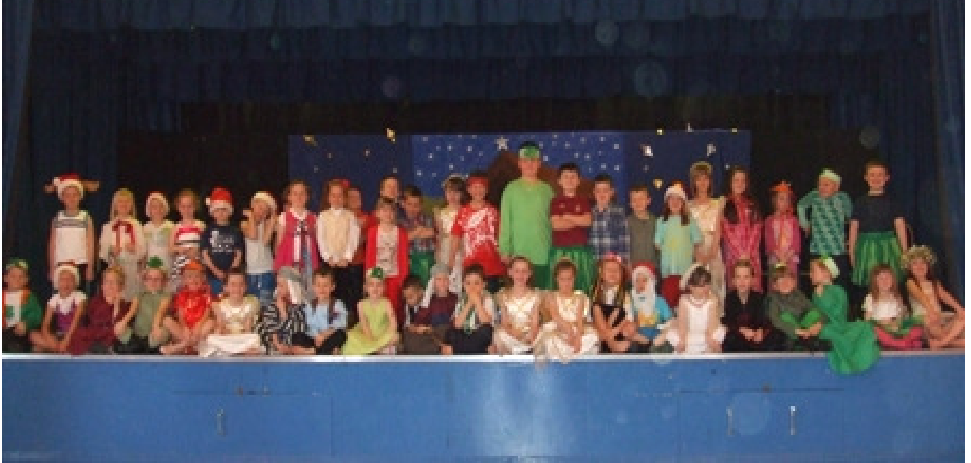
"Children of the world" performed by children from classes 1 & 2

Despite the many coughs, colds, headaches and sickness bugs, the children at Cotsford Infant School soldiered on to perform this year's Christmas productions.