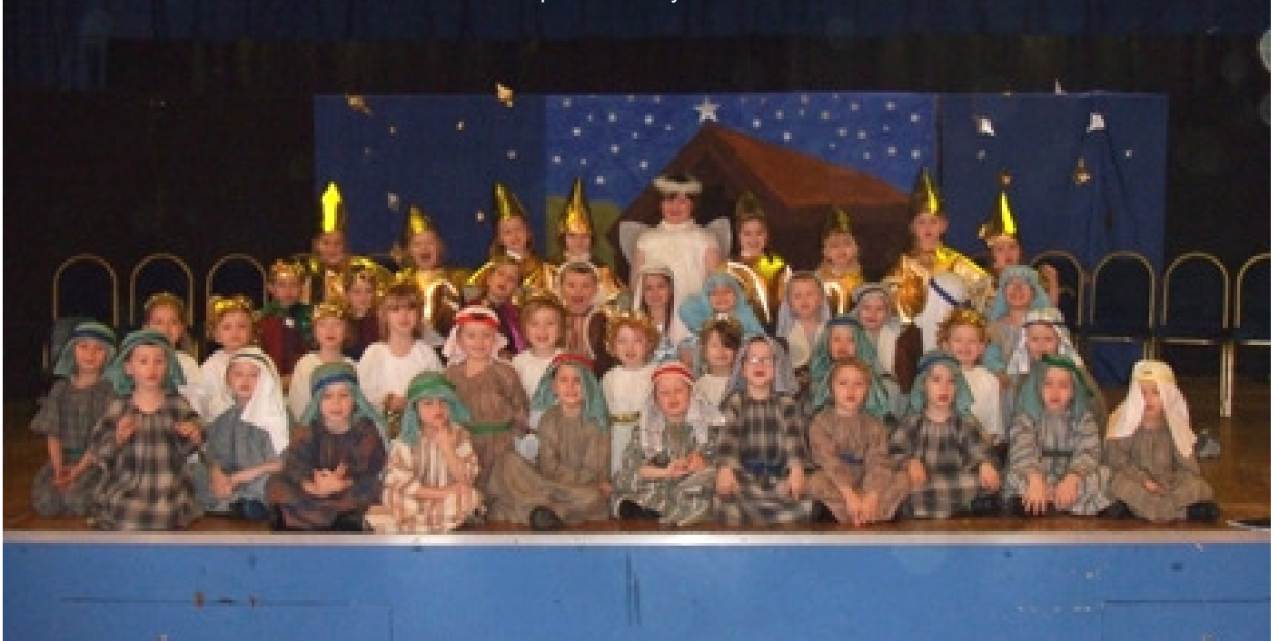
"Shine Star Shine" performed by children in classes 3 & 4

Both productions were very well attended by family members and as always we were very proud of the children for doing such a brilliant job. Well done Cotsford Infant School and thank you to Horden Social Welfare Centre for being terrific hosts.