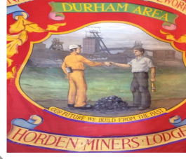
One of the banners on display at the Heritage Day