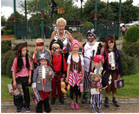
Pirates in the Park Fancy Dress Winners