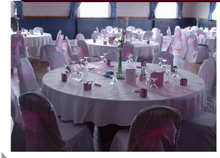
The Social Welfare Centre is available for private hire call 0191 5180823 for details